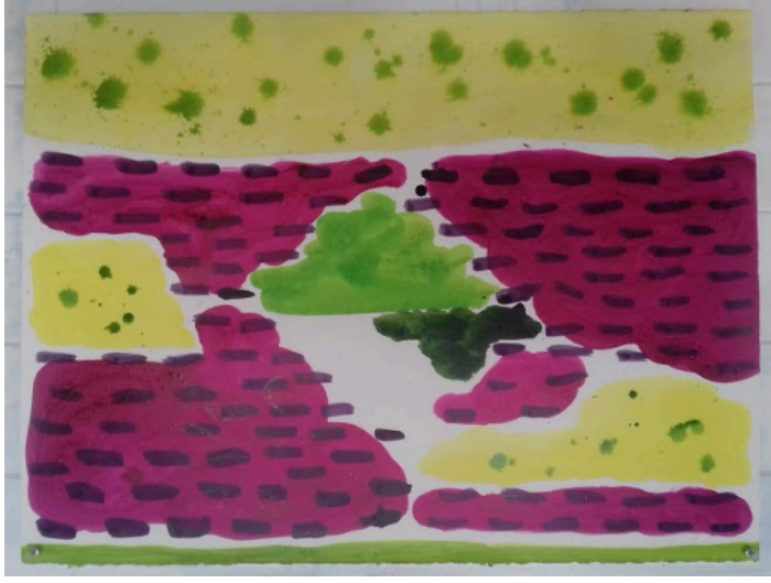
Dougal McKenzie/ Kiln Lane Drawing no. 12/ 2020