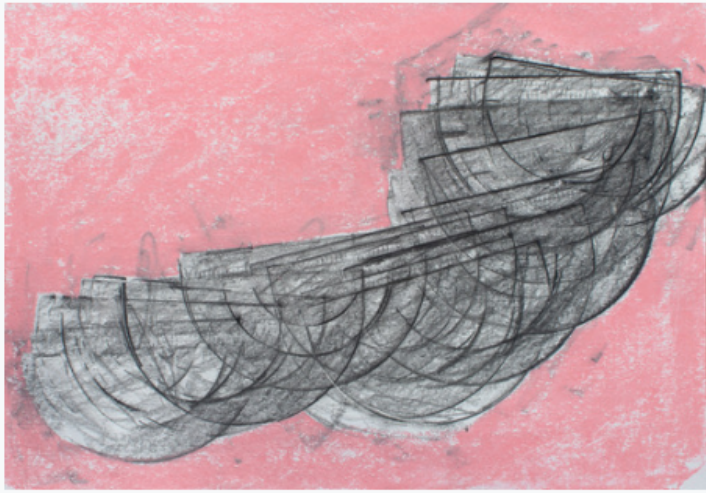
Aisling O'Beirn/ protracted/ 2021

These drawings began in June 2020, developed from a series of digital drawings I had been making on WhatsApp since the first April lockdown. Twice daily walks up Kiln Lane in Banbridge found me stopping regularly at the same particular gap in a hedgerow, for no other reason than to observe the changing landscape. It gave me a sense of purpose in these strange Covid-19 times, and here we are again looking to another Spring. The drawings have attempted to put some shape on the shaky ground of lockdown.