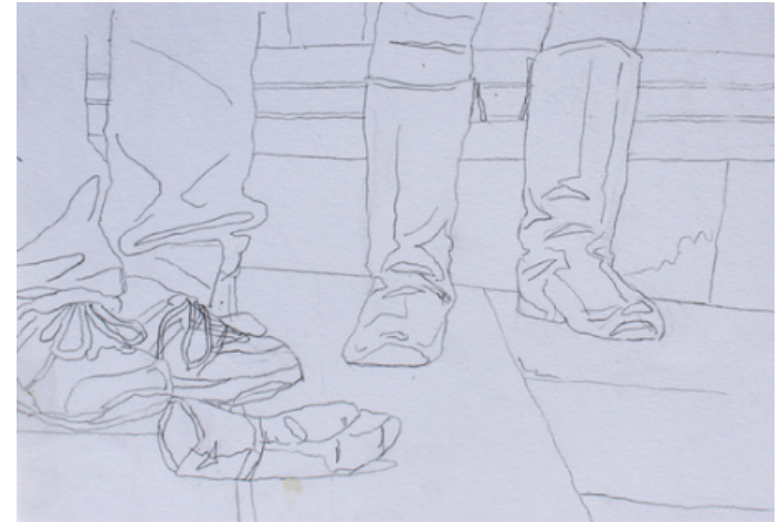
Aisling O'Beirn/ dropped gauntlet/ 2021