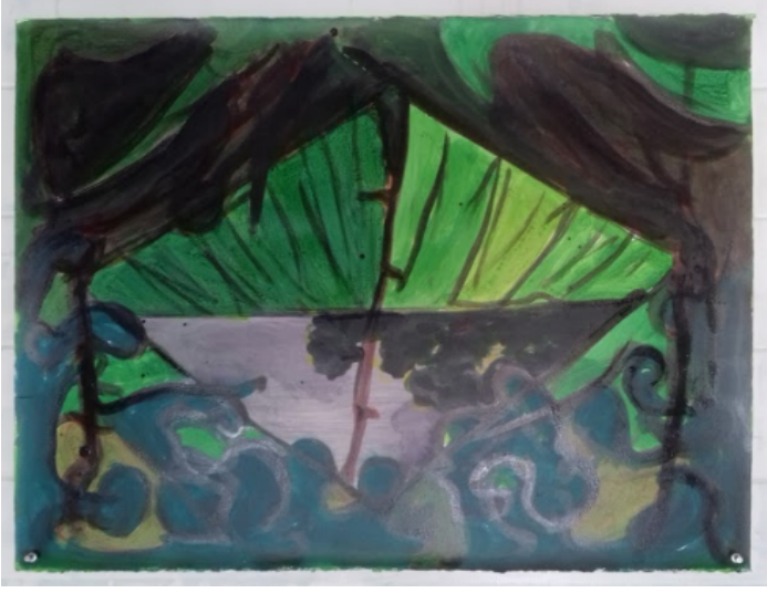
Dougal Mckenzie/ kiln lane Drawing no. 4 / 2020