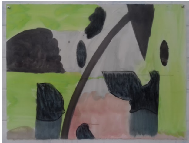
Dougal McKenzie/ Kiln Lane Drawing no. 31/ 2021