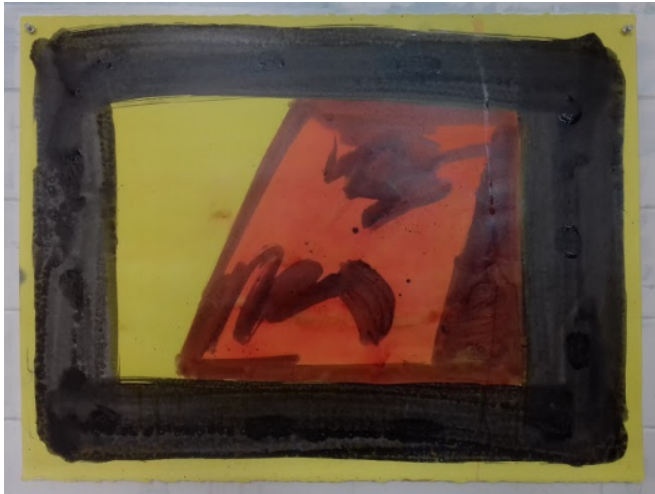
Dougal McKenzie/ Kiln Lane Drawing no. 21/ 2021